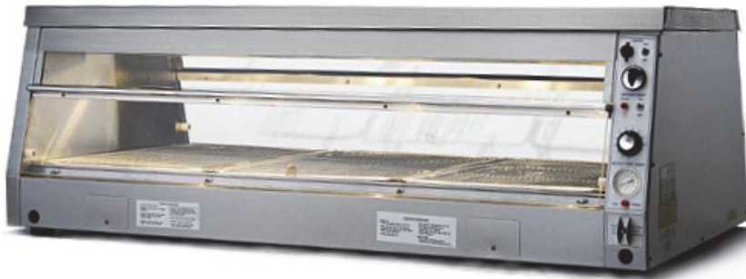
HCW 3 display counter warmer with flip-up doors for pass-through service

Henny Penny display counter warmers are designed for accumulating, holding and displaying hot fresh food for serving or packing at the point of sale in retail foodservice operations.